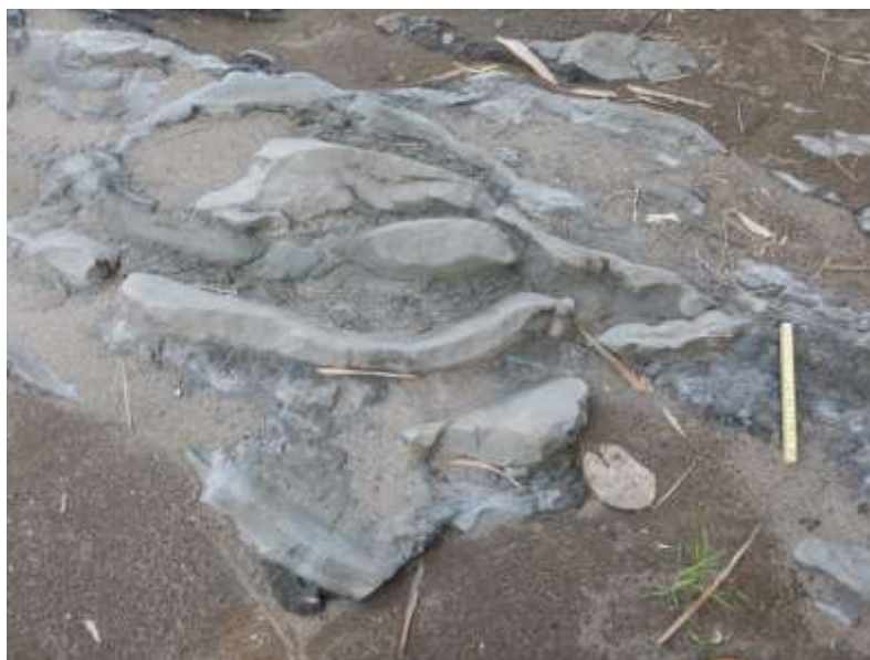
Fig. 5. Slump deposits