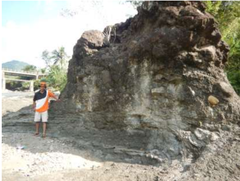
Fig. 4. Component-supported breccia exposed in Cijurey River