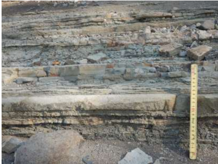
Fig. 2. Thin-bedded sandstones and mudstone in the Cijurey River