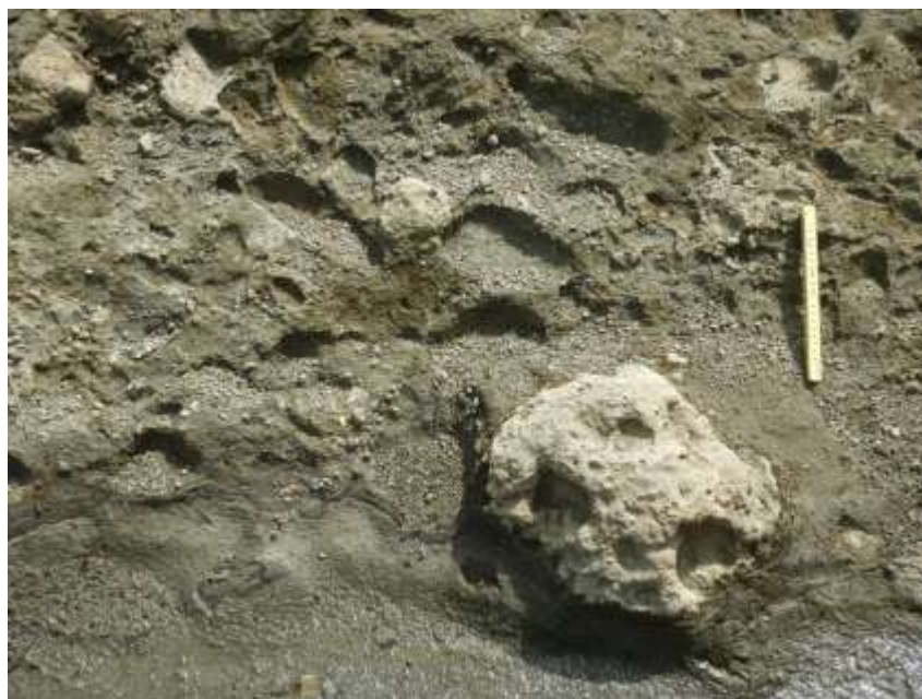
Fig. 3. Pebbly mudstone