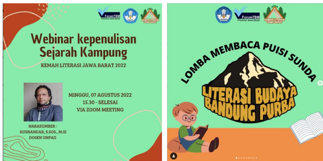
Picture 2. Webinar on writing village history and Sundanese poetry reading competition

The Webinar of Village History Writing is a training session writing for reading communities. Volunteers of Reading communities writed village history. After that, they joined at the West Java Literacy Camp activity and performanced their writing. Reading communities taken part in Sundanese poetry reading competitions in the West Java region. The winners on the first, second, and third place performed at the West Java Literacy Camp. Universities collaborated with Forum of Reading Community West Java Province as editors the books.