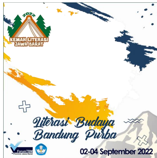
Picture 1. Poster of Ancient Bandung Literacy

The Webinar of Village History Writing is a training session writing for reading communities. Volunteers of Reading communities writed village history. After that, they joined at the West Java Literacy Camp activity and performanced their writing. Reading communities taken part in Sundanese poetry reading competitions in the West Java region. The winners on the first, second, and third place performed at the West Java Literacy Camp. Universities collaborated with Forum of Reading Community West Java Province as editors the books.