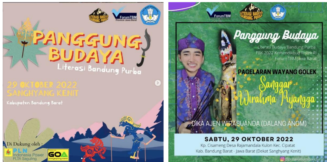
Picture 5. Cultural performance program

development Sundanese cultural in West Java Province. The speakers in talkshow were lecturers, artist, and community as a writer on the book of village historical. Lecturers from Universitas Pasundan and Universitas Padjadjaran contributed as speaker in talkshow. They discussed about folklore, music, or traditional cultural in Sundanese and important of writing the Sundanese Cultural. Era will fastly change. And communities will fight to preserv their cultural. Hence, Sundanese cultural should documentate and promote to communities.