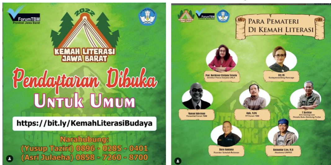
Picture 4. Literacy Camp activity

The biggest event from Ancient Bandung Literacy is the Literacy Camp for two (2) days. Volunteers of Reading Communities West Java Province convened at Kiara Payung Campground, Jatinangor, Sumedang, contributed in literacy activities. Forum of Reading Community West Java Province collaborated with lecturers, practitioners, the government, and managed literacy classes every day. Universitas Padjadjaran and Universitas Langlabuana participated as speakers, participants, and consultants on this program.