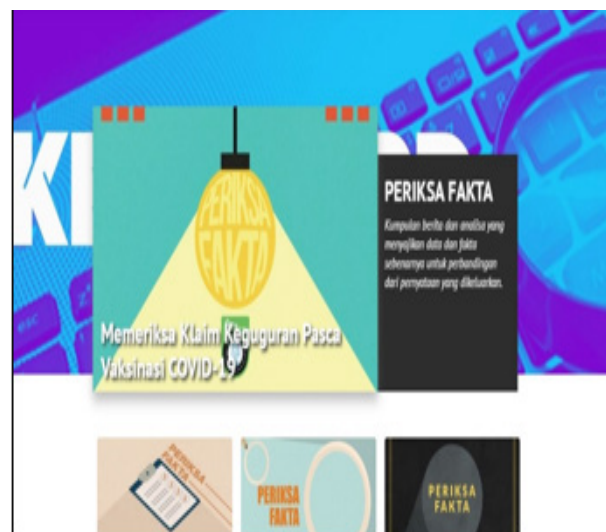
Figure 2 Fact-Check webpage owned by Suara.com