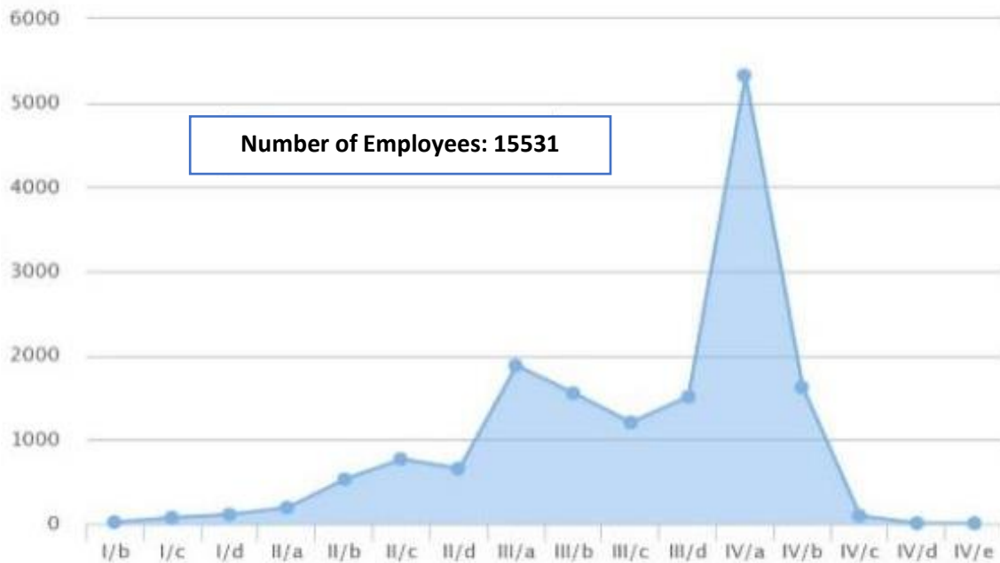
Figure 2. Number of Employees