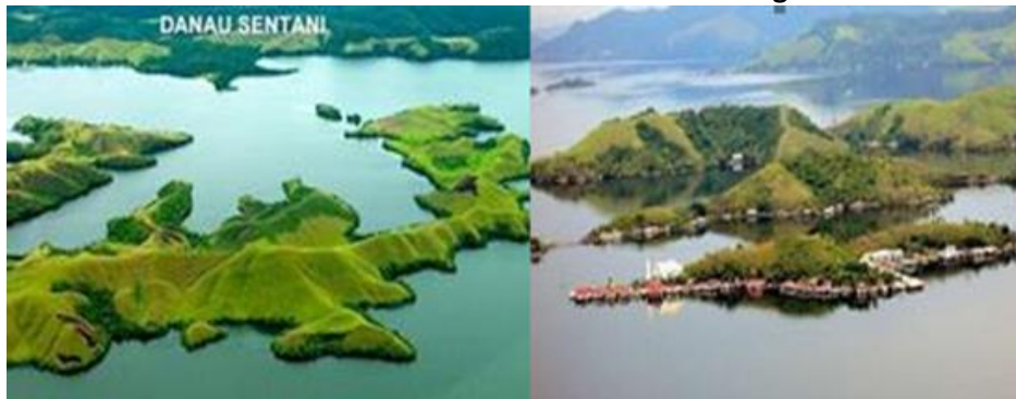
Figure 4. Actual State of Lake Sentani Tourism Image

Outbreaks are not always an ongoing problem, this provides another way out, namely by using social media and digital space to further introduce Lake Sentani to the wider community. Furthermore, with the loosening of the Covid-19 alert status rules or the start of life (new normal era) the destination area has reopened and is busy inviting visitors back through promotional means. The result is a significant increase in people visiting Lake Sentani especially at the same time as national events, namely PON (National Sports Week) and Peparnas (National Paralympic Week) which have had a tremendous impact on the economy and people's welfare. (Sawir, M, and Qomarullah 2022). The following are the existing destinations for the Lake Sentani tourist area: