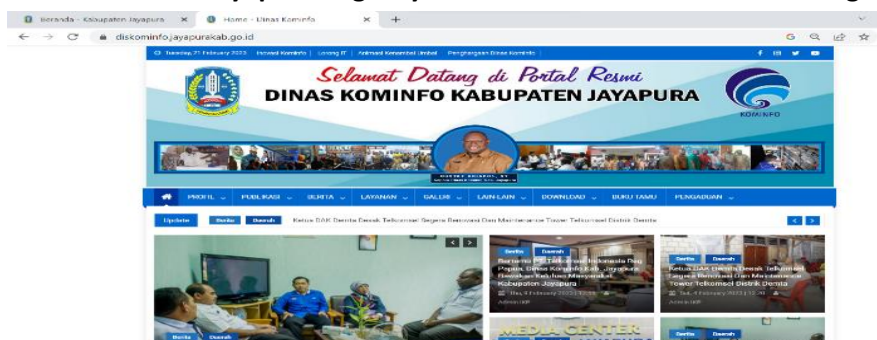
Figure 3. Official Portal of the Jayapura Regency Communication and Informatics Agency