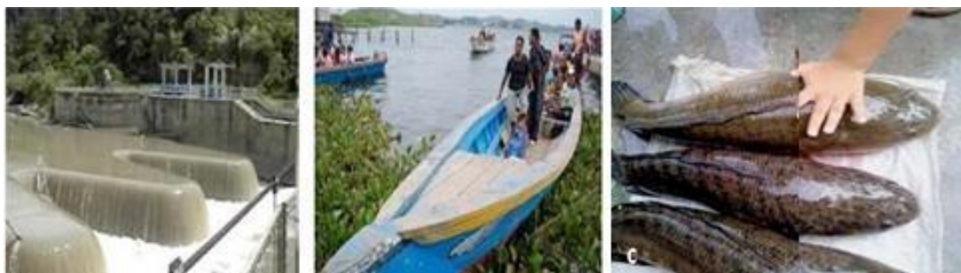
Figure 6. Lake Sentani Water Sports and Culture Festival