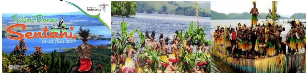
Figure 5. Existing Conditions of Several Utilization Functions of Lake Sentani