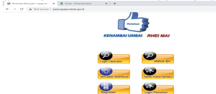
Figure 2. Types of Regional Government Services in Jayapura Regency