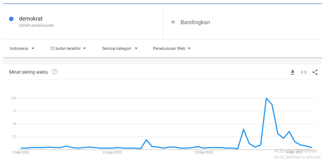
Figure 1 Analysis of Democratic Party search keywords

Related to the case of the “coup” that had occurred in Indonesia, in early 2021 the case of this “coup” happened again in the Democratic Party. Therefore, the case of the “coup” gained the attention of the public. Based on the analysis of search keywords, in early February 2021, the Democratic Party received quite a lot of attention.