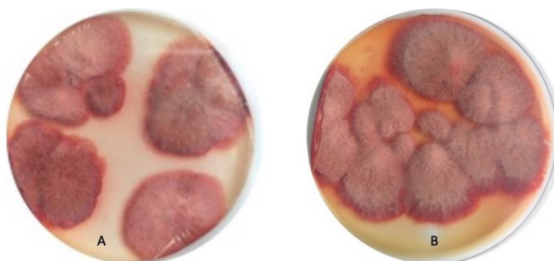
Figure 1. Macroscopic observation results of (A) mold isolated from red yeast rice (B) Culture of M. purpureus ITBCCL61