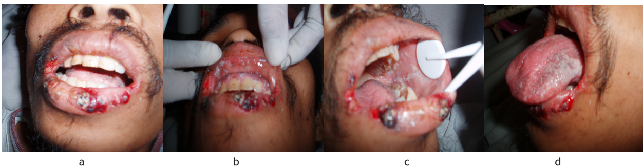
Figure 2. There are still yellowish crusts on upper lip, dark red crusts on lower lip with bleeding and fissured lip corner with bleeding. (a). White plaque on labial mucous is seen as well as along the buccal mucous occlusal line. On the tongue lateral area, the plaque amount increases and thickens (c,d).