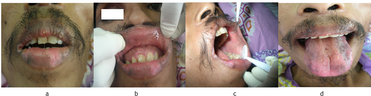
Figure 3. Improved Herpes Labialis and Oral Candidiasis.