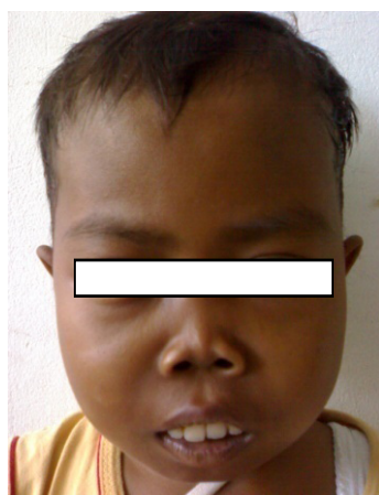
Figure 2. Facies Cooley.

The kidney is usually enlarged as a result from extra medullar hematopoiesis with dark brown urine caused by heme catabolism product excretion. 17-20