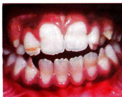
Figure 1. Moderately severe enamel hypoplasia. 7

The position and extent of the defect indicate the timing, duration and to some extent the severity of the underlying metabolic upset.