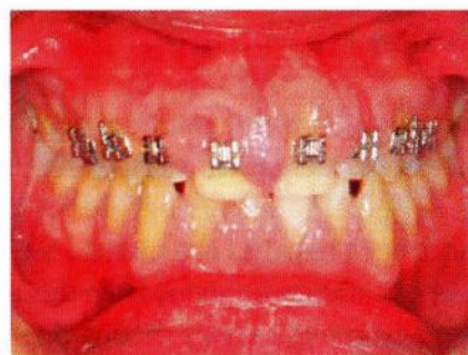
Figure 2. Gingival enlargement associated with drug therapy. 7