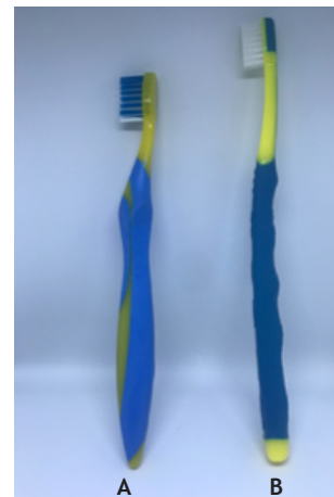
Figure 1. A. Child's tooth brush; B. Parents' toothbrush

The type of study chosen based on the objectives to be achieved was quasi experimental. Population taken was student at YPLB Cipaganti Special Needs School-C (SLB-C) Bandung. Sampling technique used was total sampling. The subjects were 29 children with inclusion criteria for girls or boys with mental retardation that their parents or caregivers have been given tooth brushing technique by using parents' toothbrush and regular toothbrush (Figure 1); having teeth 16, 26, 11, 31, 36, and 46; and not using a fixed or fixed orthodontic appliance. Parents' toothbrush is a designed brush with a long handle to help parents brush their child's teeth. Cushioned gum bumper