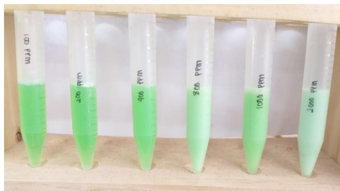
Figure 2. Visual form of mouth rinse solutions with lime essential oil active ingredients in various concentrations

Afterwards, formula with a concentration of 2% essential oil, making glycerin with concentration variation and tween as an emulsifier was carried out, as described in Table 3 and Figure 2.