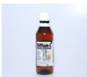
Figure 3. Mouth rinses B : Diffiam C