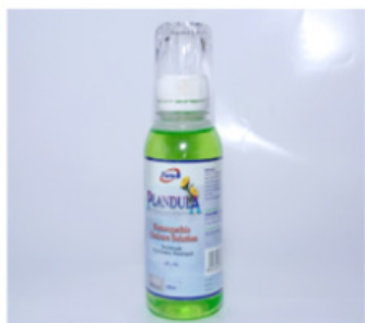
Figure 2. Mouth rinse A: Plandula® mouthrinse containing the extract of Calendula officinalis (0.64%)