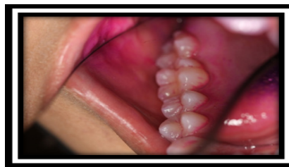
Figure 6. All teeth present in maxillary were assessed except 3 rd molars

Due to the double-blind design, all bottles were covered with the black plastic and were kept in the same kind of bottle (Figure 4). Two dental surgery assistances were included to assist along the study. The assessor and the participant did not know the allocated mouthrinse until completion of the study. At the baseline, of each test period, all participants received a dental prophylaxis to remove plaque, calculus and stain from all tooth surfaces to make plaque become zero. They were randomly assigned to the allocated mouthrinse. All participants were randomised for 2 different allocated mouthrinse using randomisation plan generator. 13