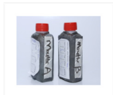
Figure 4. Mouthrinse A and B (bottles were covered with the black plastic and were kept in the same kind of bottle)