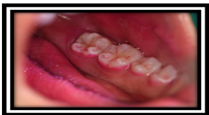
Figure 5. All teeth present in mandibular were assessed except 3 rd molars