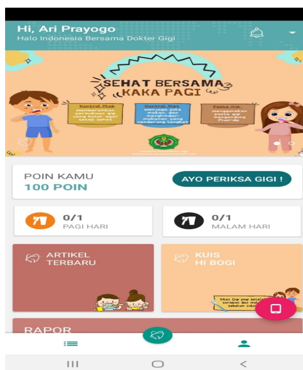
Figure 1. Preview of HI BOGI application preface which displayed oral health e-posters, oral health articles, HI BOGI quizzes, and user oral health report card

Figures below shows the preview of HI BOGI Application on Android based. Currently HI BOGI application is only available in Bahasa. Therefore, the application will be developed and will be available in IOS and English version.