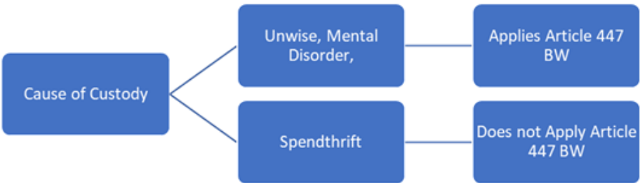
Figure 1. Applicability of Article 447 of the BW

The above conditions are described in the Supreme Court Decision No. 639 K/PDT/2018 on the case of Mintaria, Yulwati and Gunawan Chandra. The position of this case is as follows.