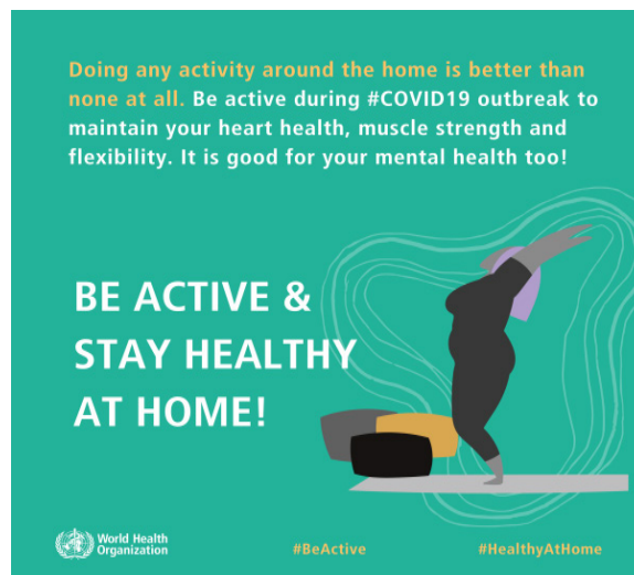
Figure 2. Be active & stay healthy at home!

Pragmatic analysis was used to examine verbal data using the Speech Act framework from Searle (2005) and the direct speech act and indirect speech act from Yule (1996). The text "Be active at home during #COVID19 outbreak!" is a poster title in the form of an imperative with directive illocutionary power so that it is categorized as a direct speech act. The following sentences, namely "Try exercise classes online", "Dance to music", "Play active video games", "Try skipping rope", and "Do some muscle strength & balance training" are also imperative with directive illocutionary power so that they are categorized as a direct speech act.