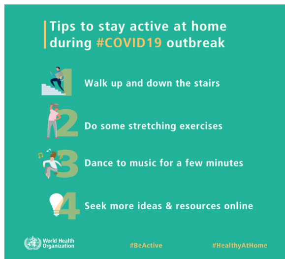
Figure 4. Tips to stay active at home during #COVID19 outbreak

The visibility of the text is clear with the choice of white color that contrasts with a green background to make the writing easier to read. The yellow color in the text #COVID19 and 30 minutes/day and 1 hour/day emphasizes something that must get attention, namely being aware of the Covid-19 outbreak and the duration of physical exercise is 30 minutes for adults and 1 hour for children. Separate text construction, namely “If you are at home during #COVID19 outbreak” at the top serves as a heading or main element, then continued by sentence construction at the bottom “WHO recommends that all healthy adults do 30 minutes /day of physical activity, and children should be physically active for 1 hour/day” as an explanation in the form of a description of the recommended duration when doing physical activities at home. Other symbols include the WHO logo, the slogans #BeActive and #HealthyAtHome which reinforce the contents of the WHO’s appeal to maintain health by actively doing physical activities at home during the Covid-19 outbreak.