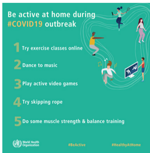
Figure 1. Be Active at Home during #COVID19 Outbreak

namely maintaining health by always being active at home during the Covid-19 outbreak. The semiotic process of signs in the poster is divided into three types, namely iconic, indexical, and symbolic meanings.