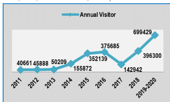
Figure 1. Graph of Domestic Tourist Visits at Klayar Beach, Pacitan

Klayar Beach in Pacitan Regency is a marine ecotourism destination located in the south of East Java Province, with a distance of 35-40 kilometers from the city center. Klayar Beach is the main destination for increasing local revenue (PAD) in Pacitan Regency. These ecotourism destinations are always included in the list of development and development plans through physical arrangement by building tourism facilities and supporting completeness facilities (Purnawan, 2018). The urgency of this development is important to implement in order to determine the pattern of readiness and feasibility of tourism components such as attractions, amenities, accommodation, accessibility, as well as ancillary or other supporting components within the scope of tourism, as well as to ensure tourist satisfaction and loyalty (Chin et al., 018; Salmon et al., 2020).