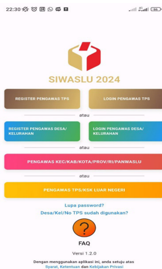
Figure 2. SIWASLU application created by Bawaslu of The Republic Indonesia

The Siwaslu application, developed by the Indonesia General Election Supervisory Board (Bawaslu Pusat), facilitates general election supervision. Its primary purpose is to simplify and improve the effectiveness of supervision by Bawaslu and the community. The application assists in reporting, monitoring, and handling election violations, so election supervision is expected to become more efficient, transparent, and responsive to violations that occur during the election process.